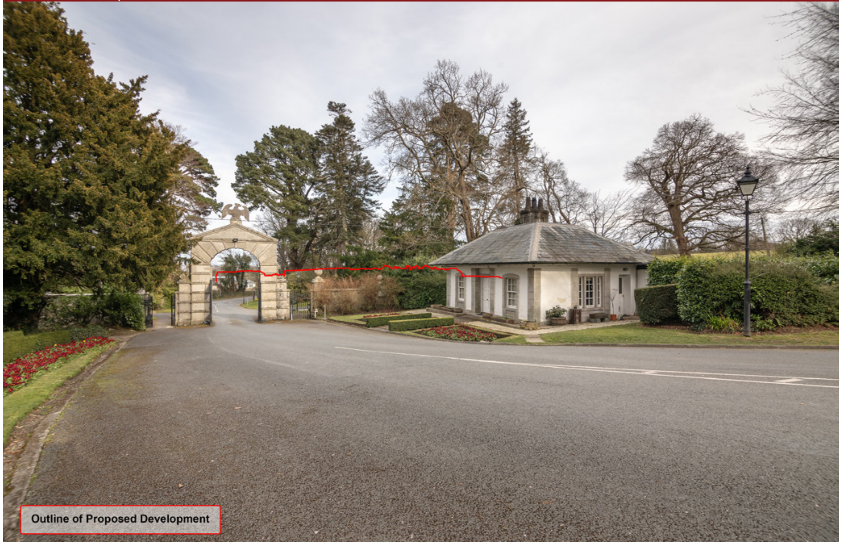
Outline of Proposed Development