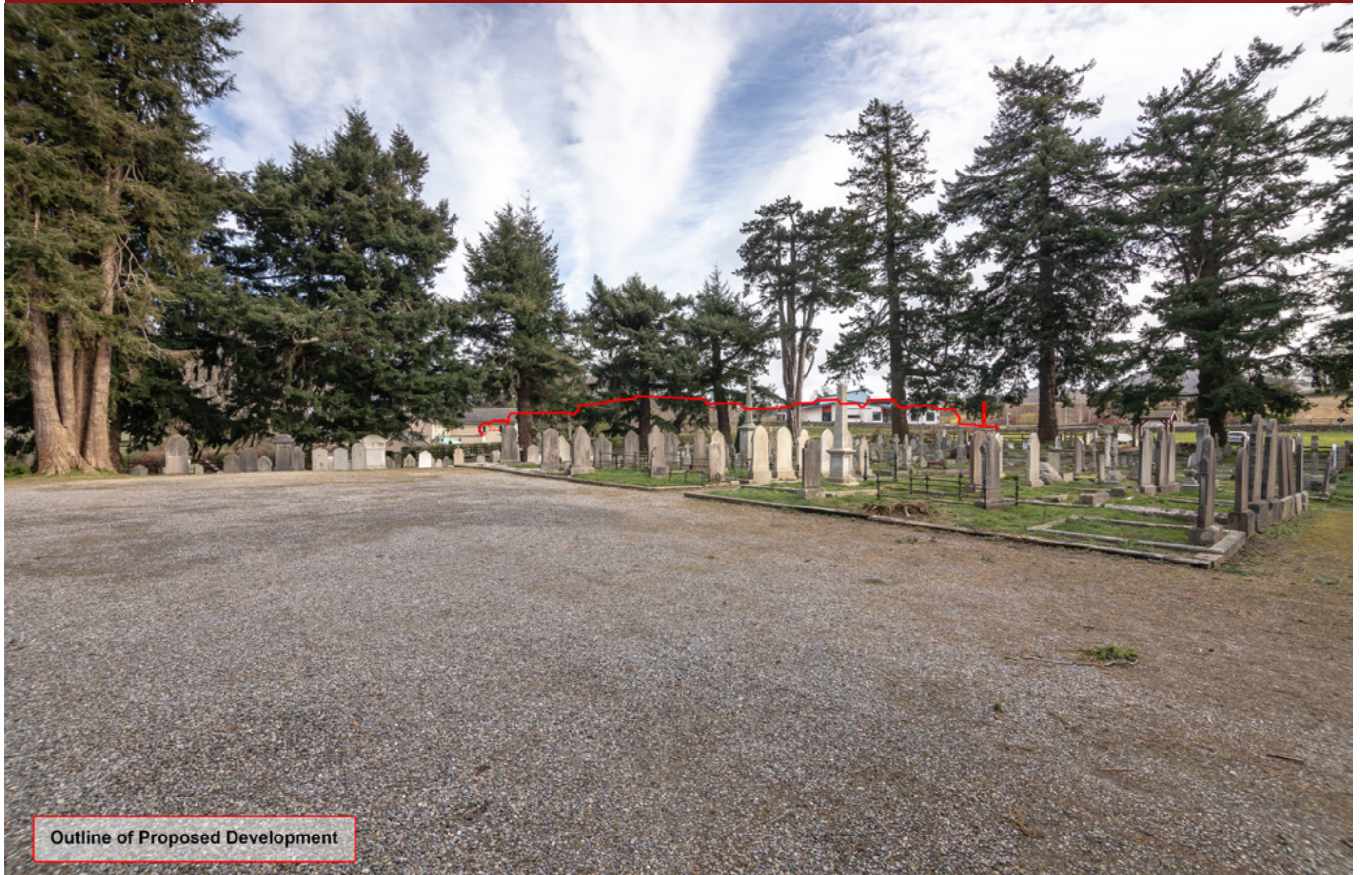
Outline of Proposed Development