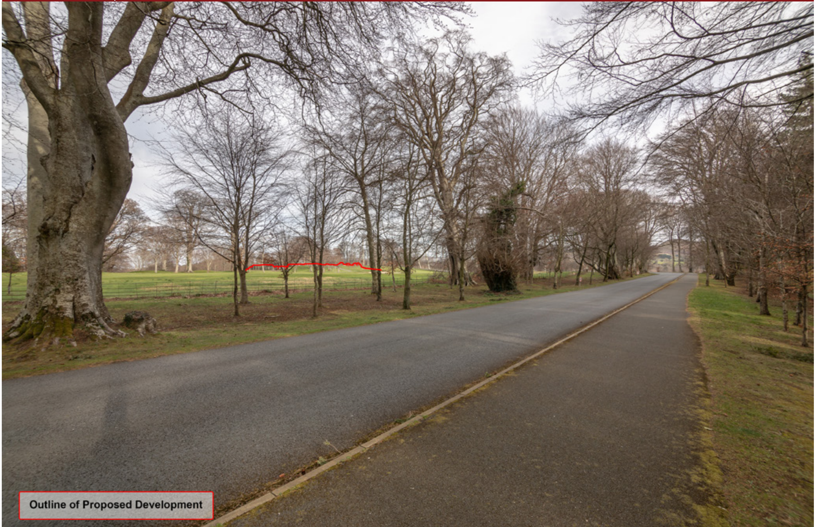
Outline of Proposed Development