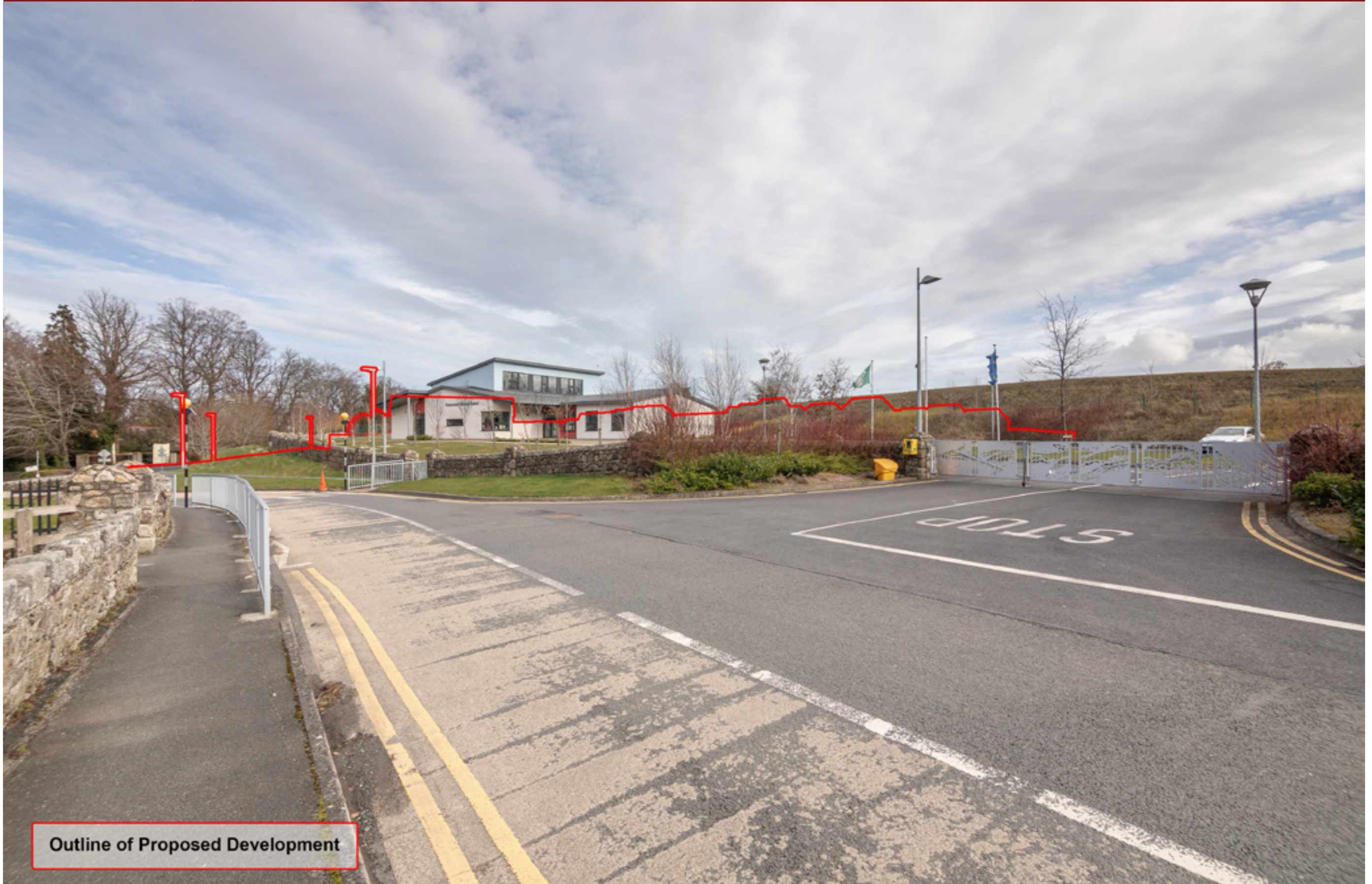
Outline of Proposed Development