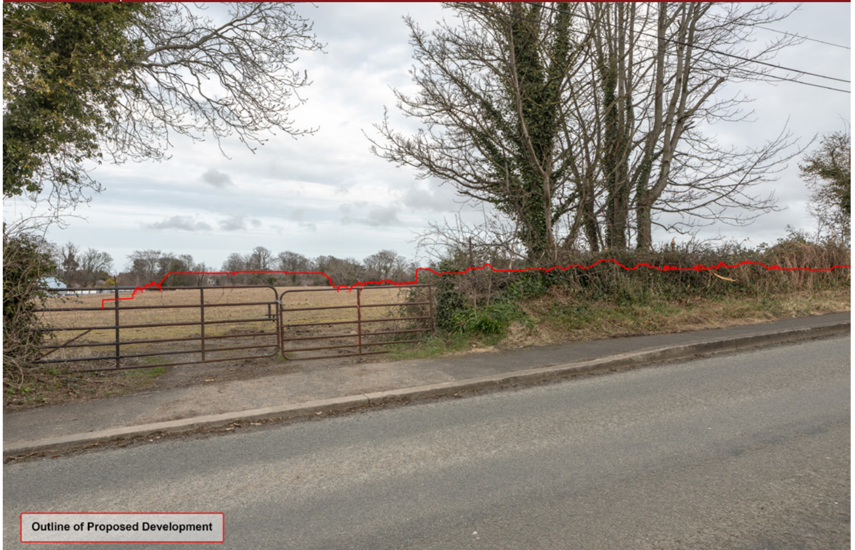
Outline of Proposed Development