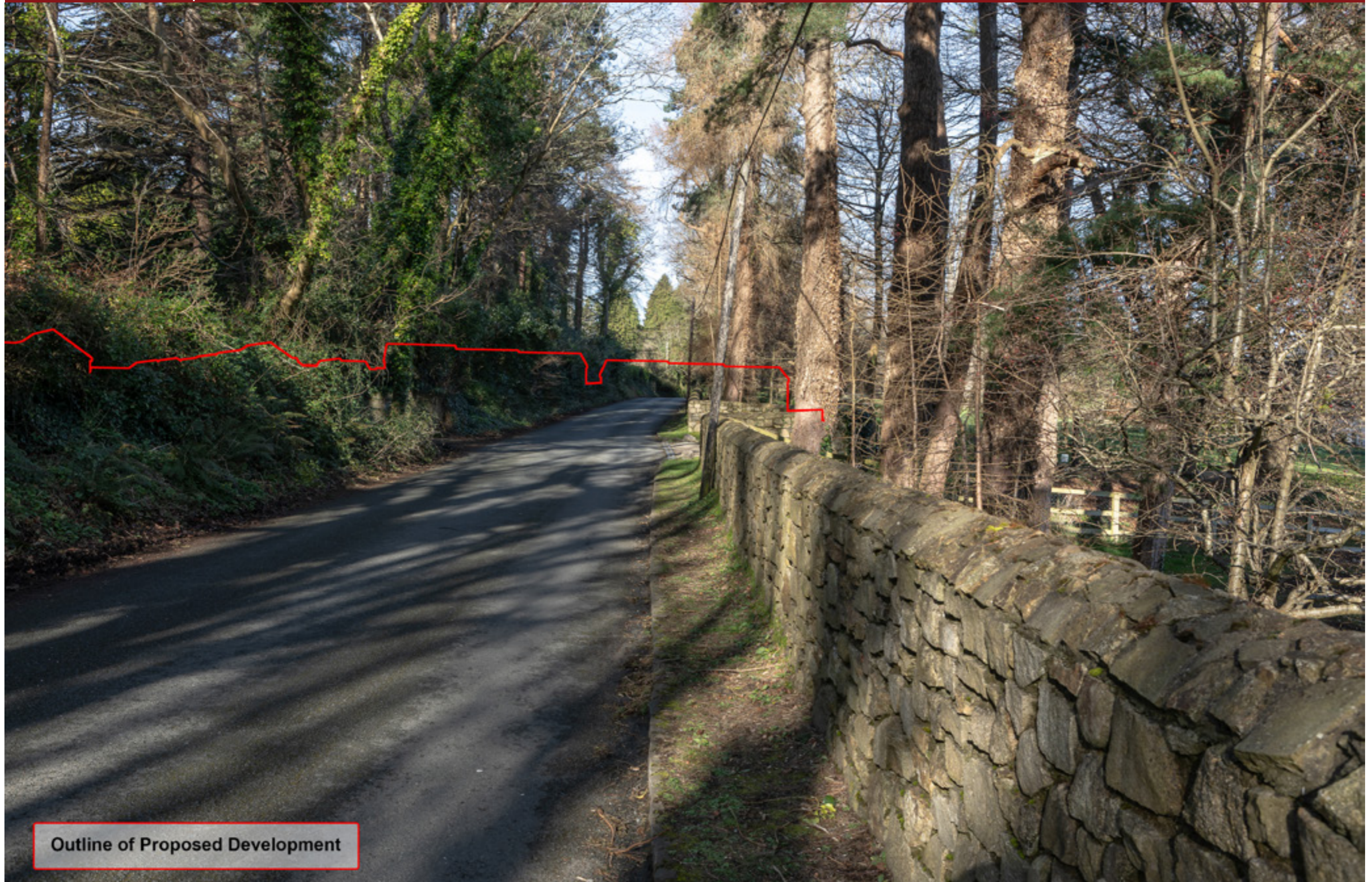
Outline of Proposed Development