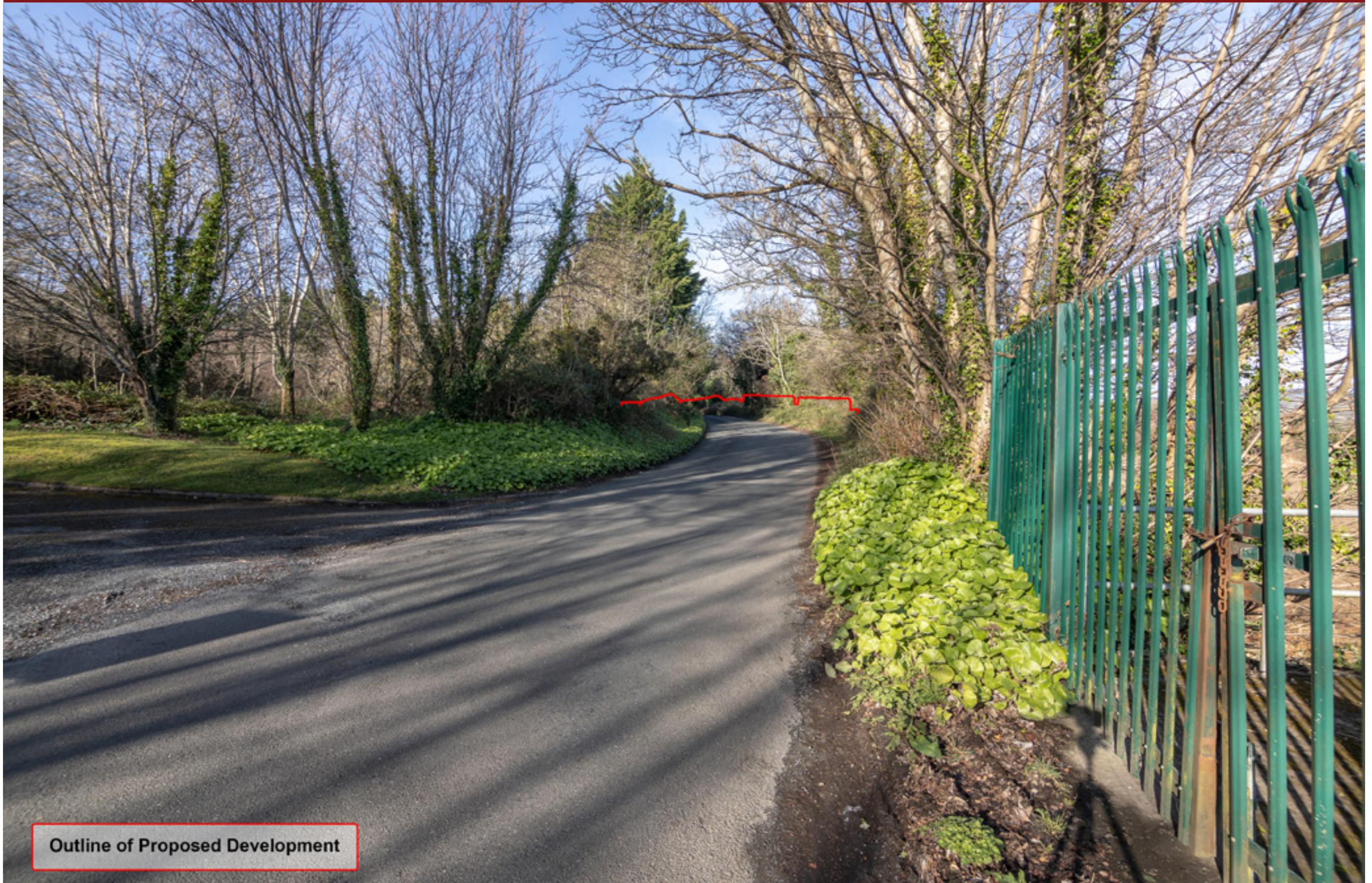
Outline of Proposed Development