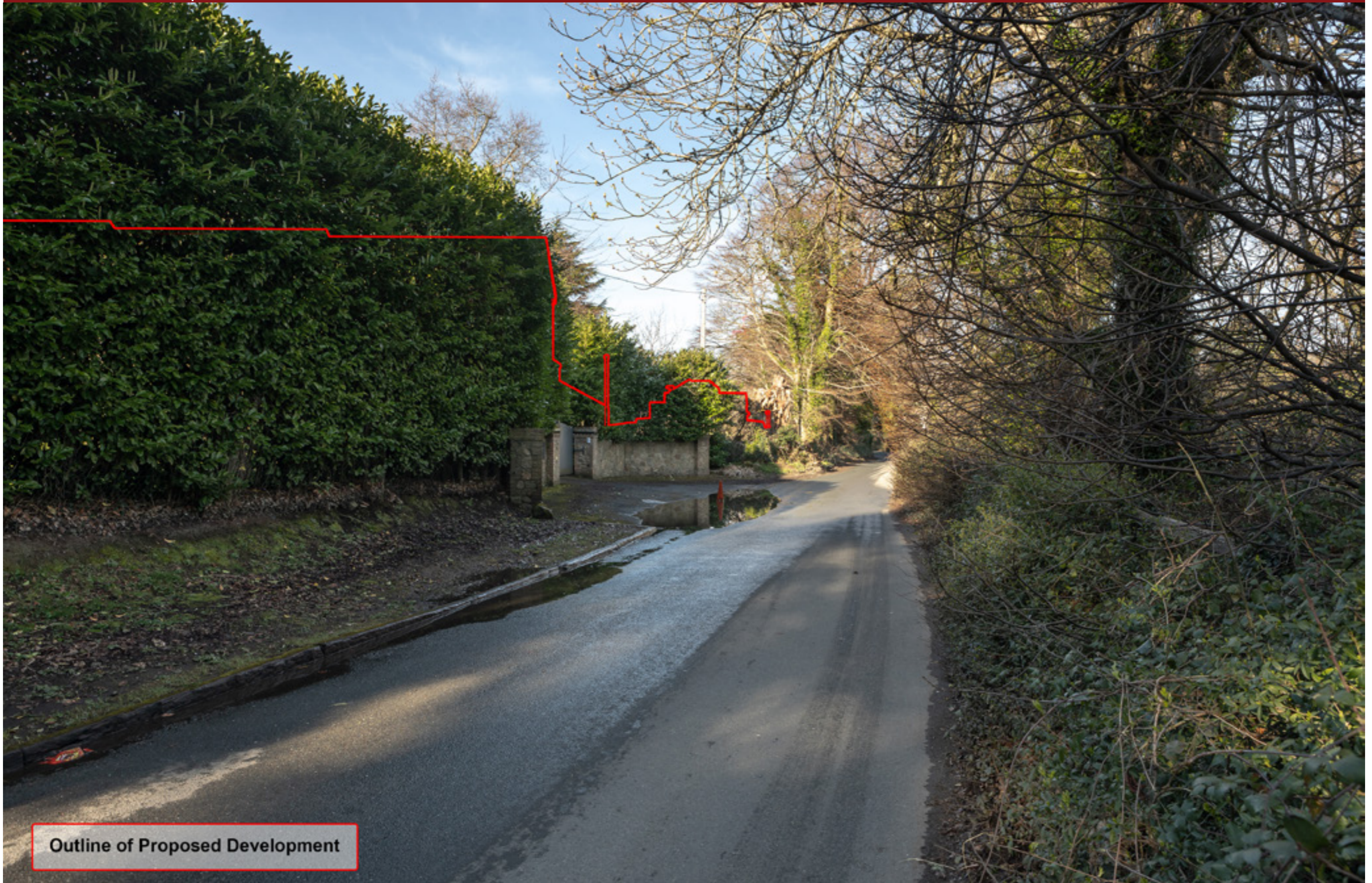
Outline of Proposed Development