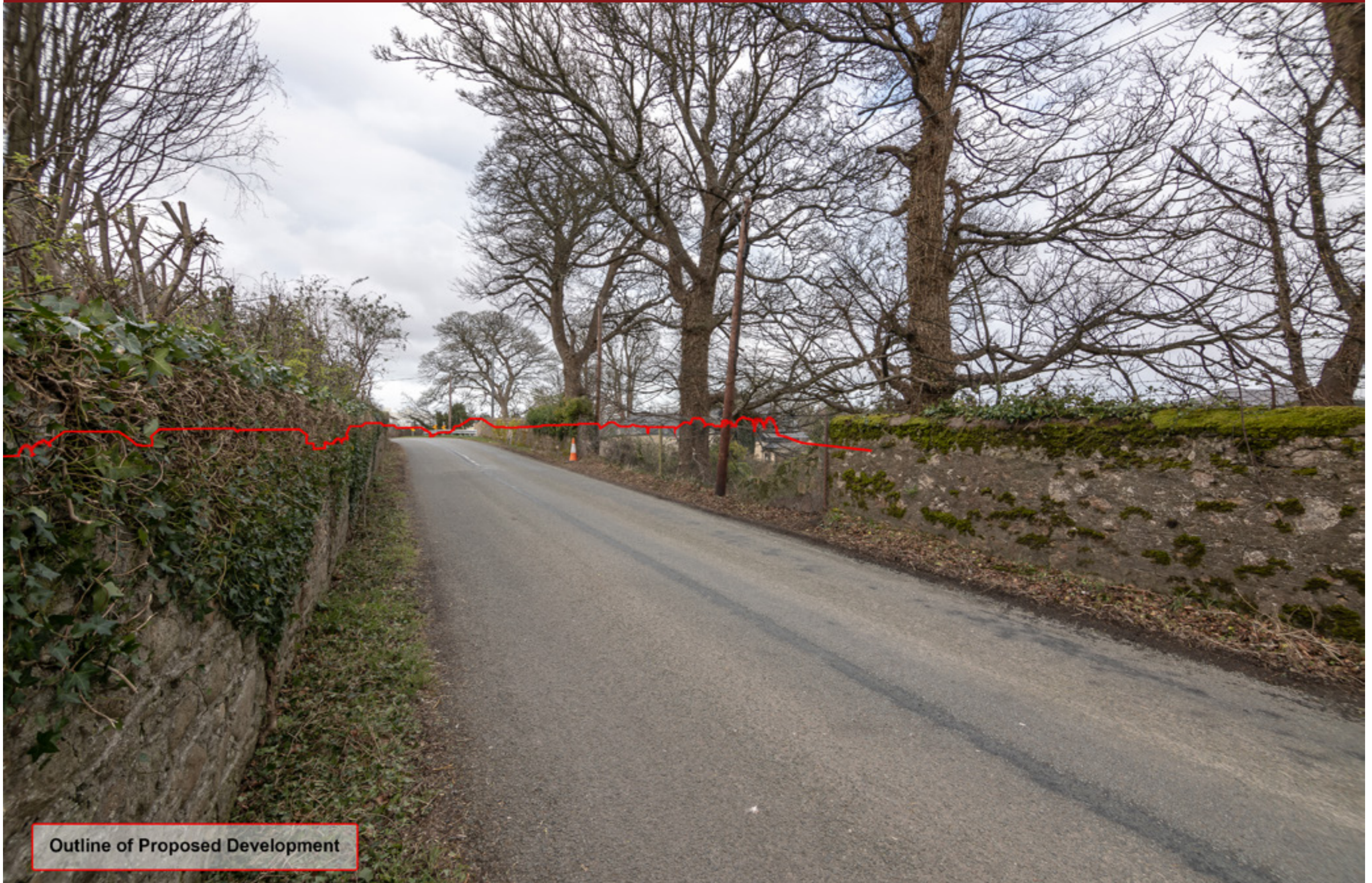
Outline of Proposed Development