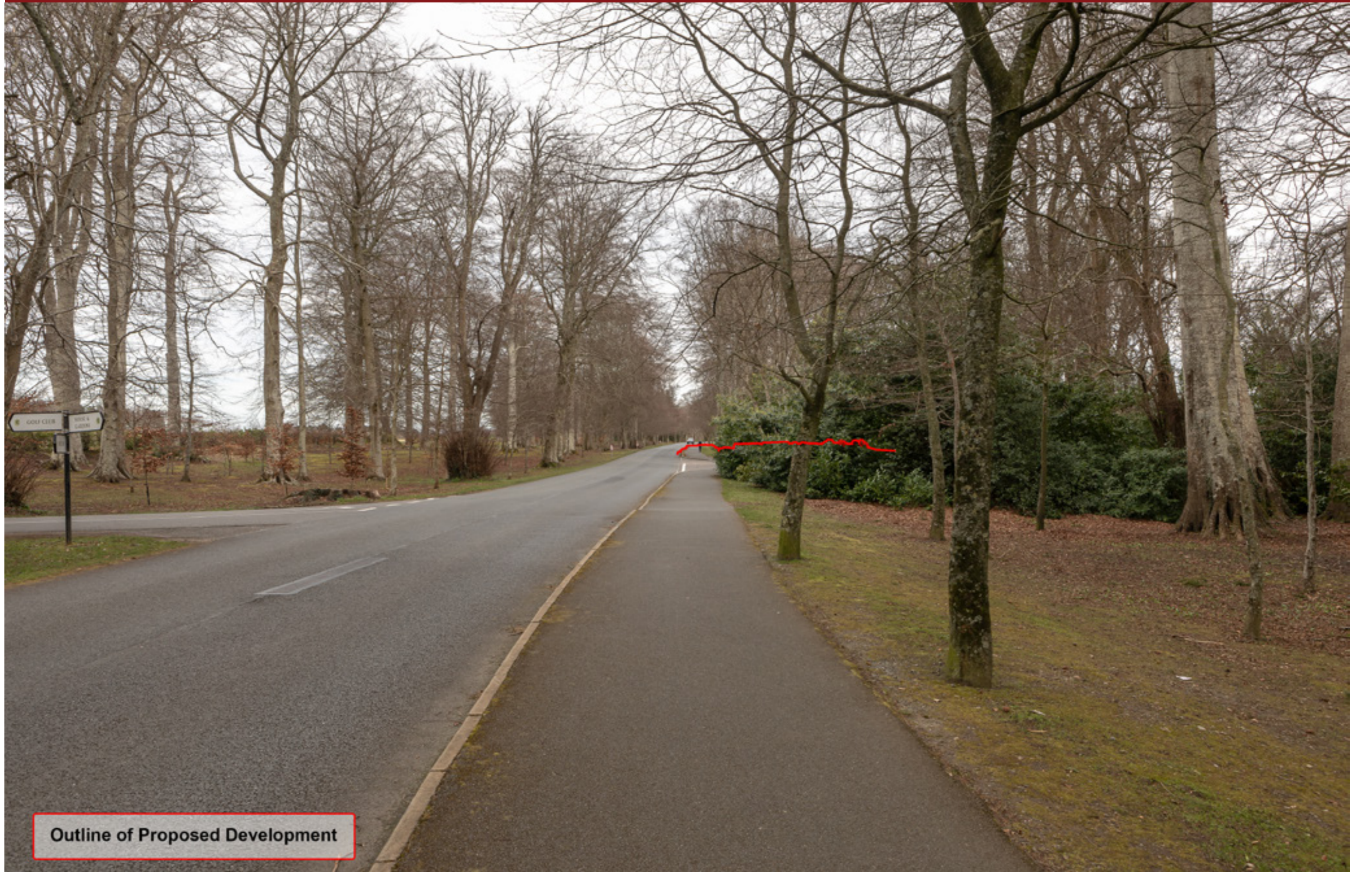
Outline of Proposed Development