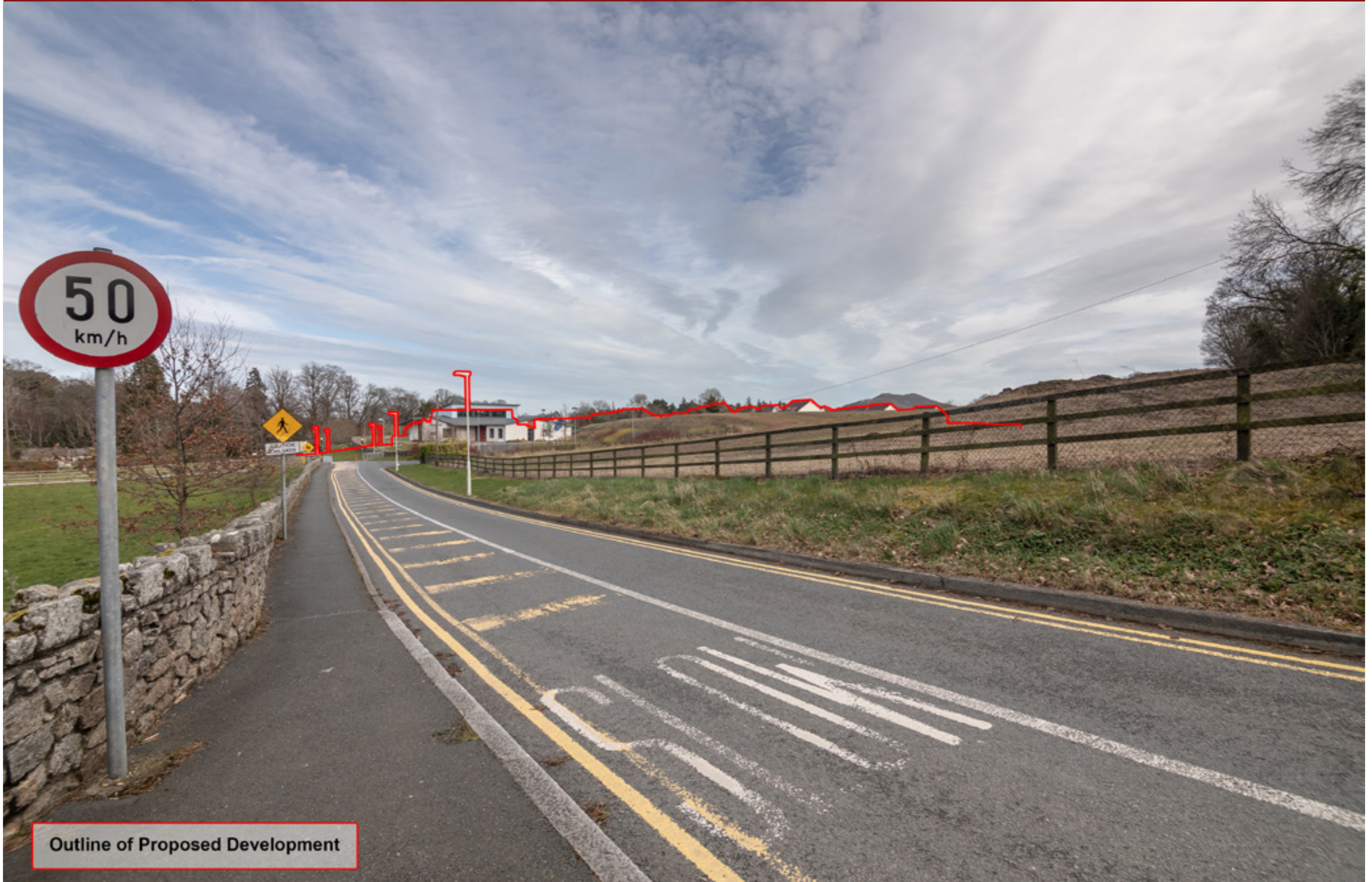
Outline of Proposed Development